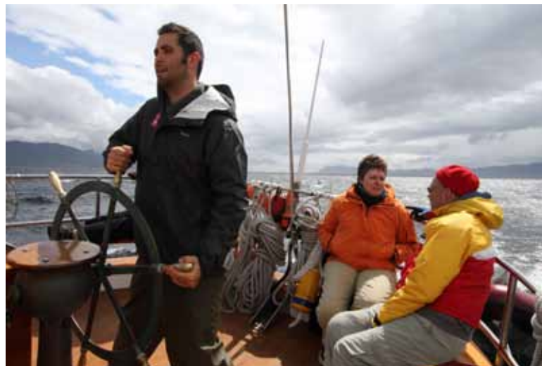
Right: One of the many on-deck seating areas, this one along the aft rail of the ship.