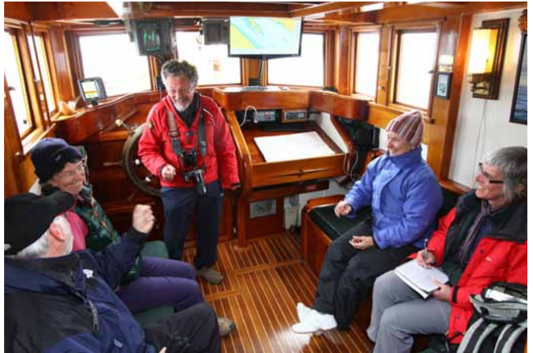
Above: The Maple Leaf's wheelhouse lounge.

She is outfitted for engaging with the natural world: rigid hull inflatable boats for accessing wildlife colonies and remote beaches, kayaks , a hydrophone for listening to whales, small temporary tanks for exploring intertidal life , GoPro underwater cameras , presentation screen & more .